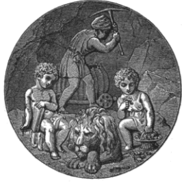
Natural History Society